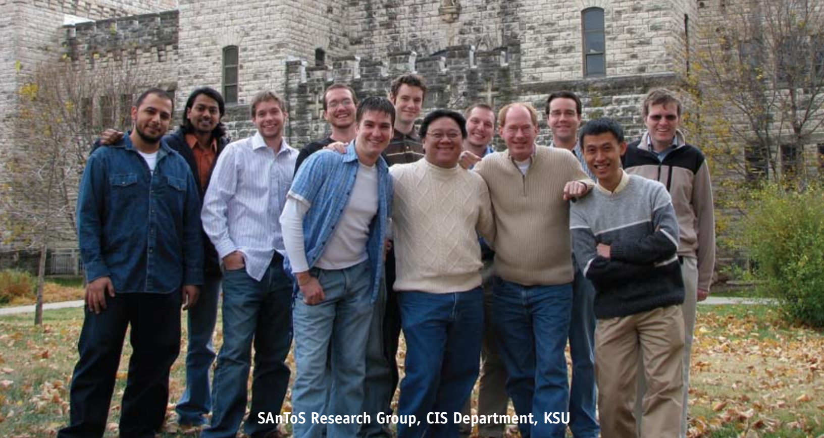
SAnToS Research Group, CIS Department, KSU

approaches for certifying secure information-flow requirements in military information assurance products.